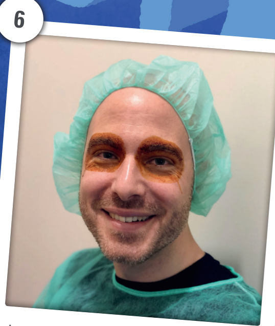
I am excited and ready to start.