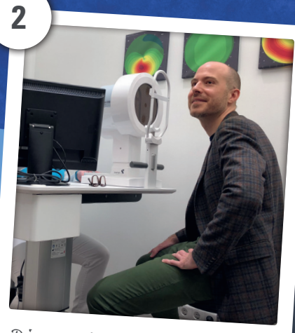
Diagnostic measurements with the GALILEI G6 (Ziemer).

Wow! This is really happening... I am getting rid of my glasses.