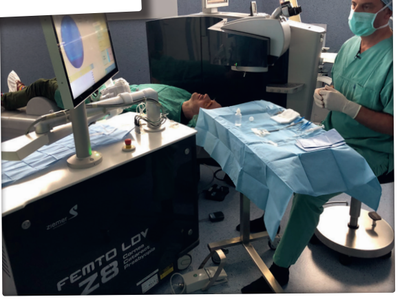
It is interesting to have the experience of a refractive surgery patient. This will help me in my future practice.